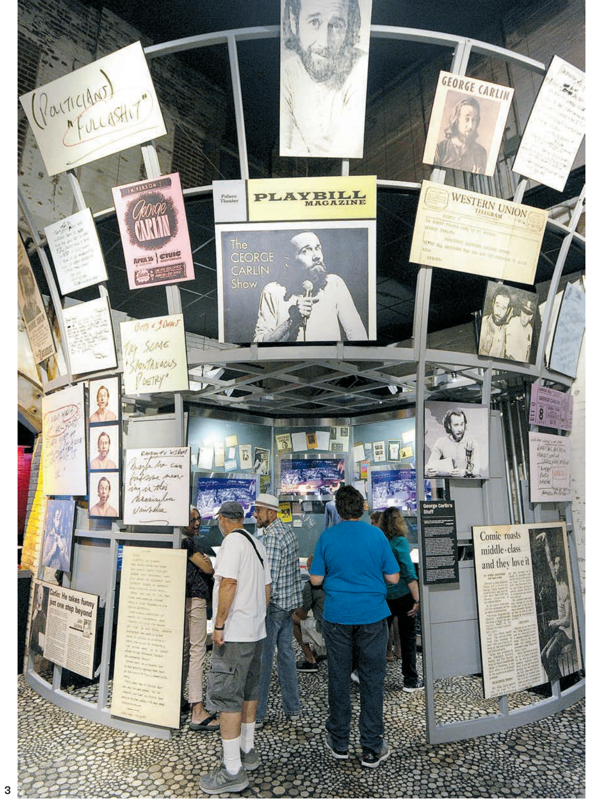
1. Chautauqua Lake is well-known for its colorful sunsets. 2. Cuban-born American actor, musician, and television producer Desi Arnaz. 3. The National Comedy Center acquired the complete archives of George Carlin in May 2016. 4. Redheaded fashion model Lucille Ball found fame as a frazzled housewife in "I Love Lucy."